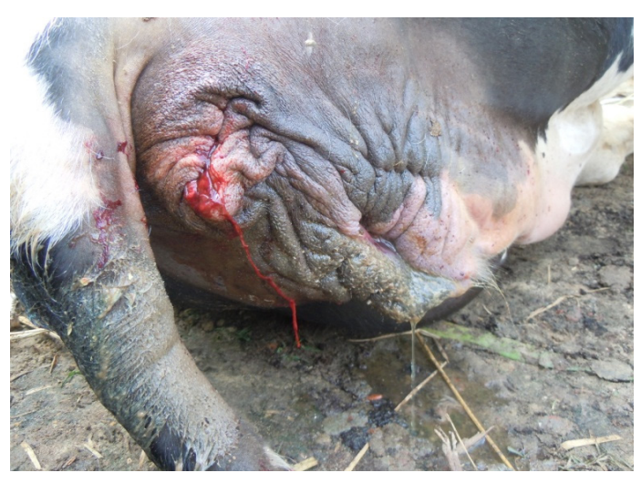
Figure4: Bloody discharge comes out from rectum