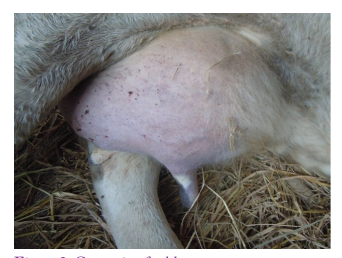
Figure3: Cyanosis of udder