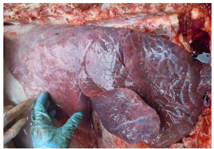
Figure 5: Collapsed lung with congestion