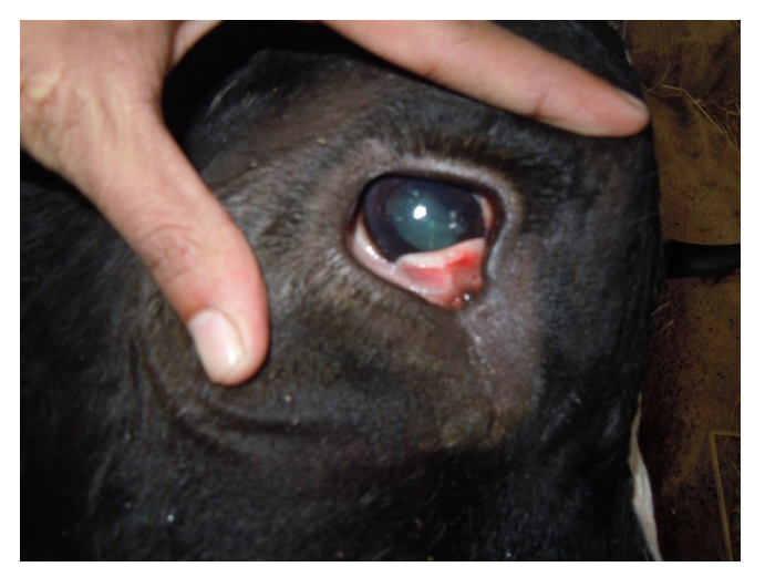
Figure 2: Conjunctiva become pale pink in color