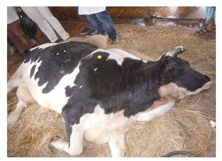
Figure 1: Died cow due to use of calcium and ceftriaxone

larly daily for 4 days), (6) Non-steroidal anti-inflammatory drugs (Ketorolac-50mg intramuscularly twice daily for 2nd to 4th days). Figure 1 showed the high yielding dairy cow that was died due to use of calcium and ceftriaxone.